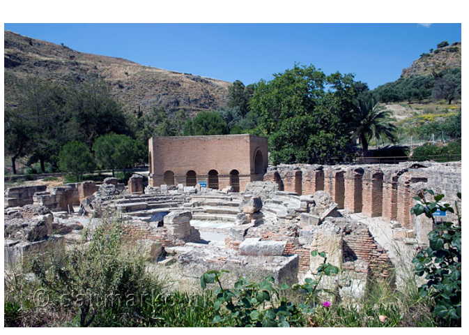
The courthouse in Gortyn